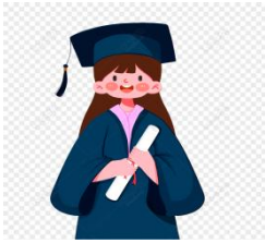
graduate / 1979

4. Look at the pictures and write down three sentences about Martha. (3X5=15 pts.)