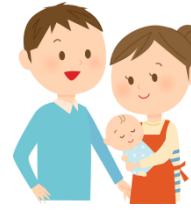
daughter / 1986

5. Read the text and fill in the chart. (4X5=20 pts.)