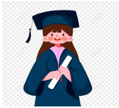
graduate / 1979

4. Look at the pictures and write down three sentences about Martha. (3X5=15 pts.)